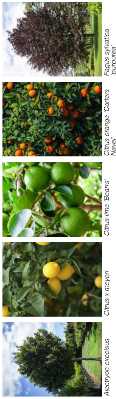
Citrus orange 'Carriers Navel'