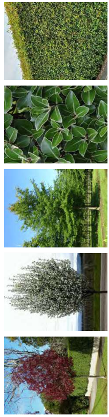
Pitiosporum ralphii Stephens Island