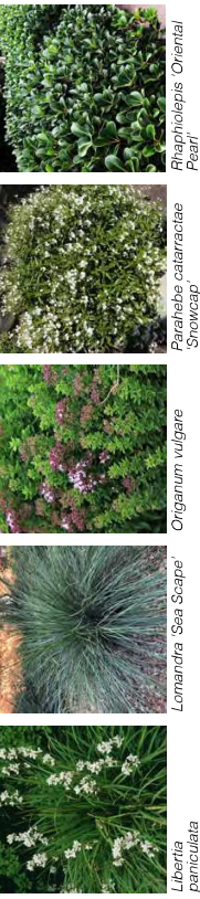
Lomandra 'Sea Scape'