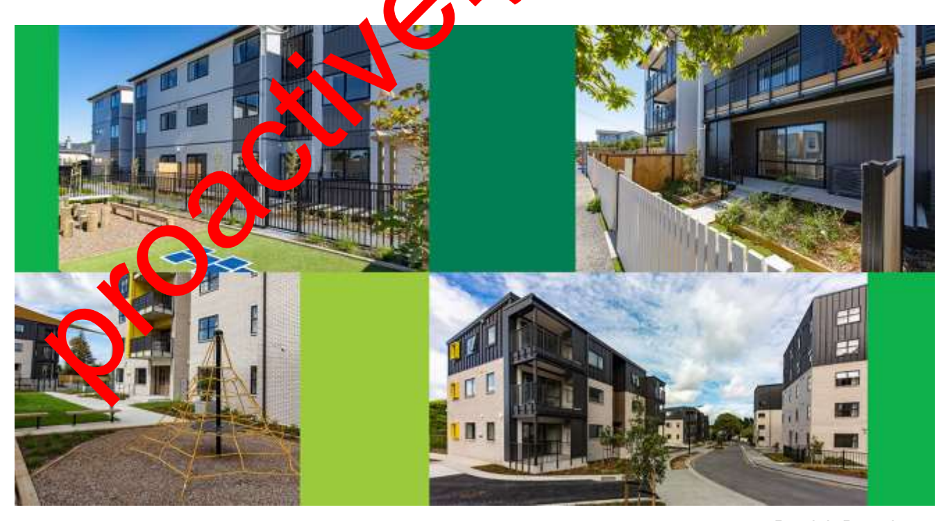
Patrick Dougherty GM Construction and Innovation

Busby Street development consists of 17 two-bedroom hones within two, three-storey walk-up apartment buildings, along with a tenancy management office and children's outdoor play area. A range of innovative materials and methodologies were used to achieve exceptional energy efficiency at Busby Street. The buildings incorporate chase-min ated timber, light timber frame panels and bathroom and laundry pods.