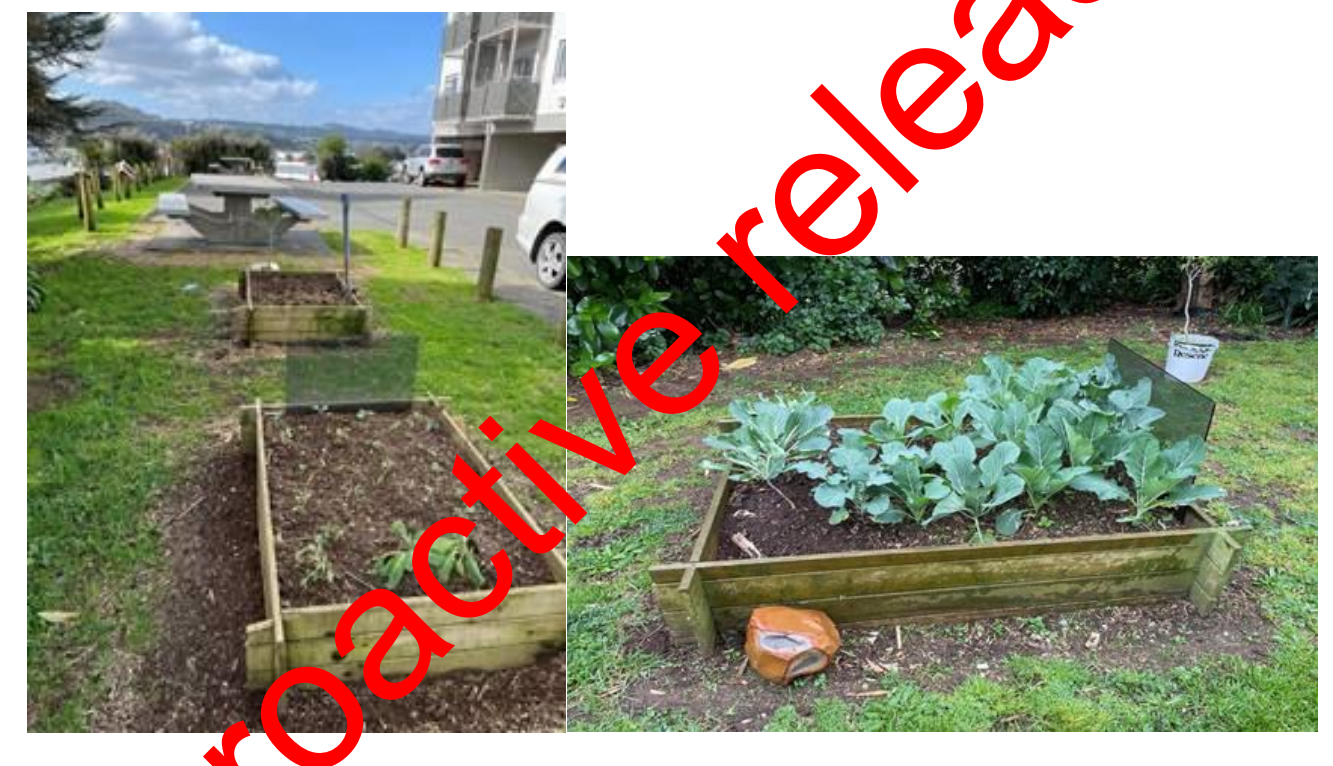
Early July planting