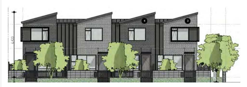
View from Killarney Road

Work on site to build these homes has begun in 2023.